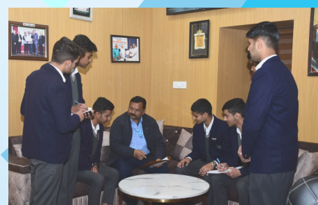
Counseling of Students