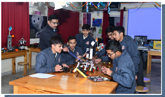
Atal Tinkring Lab