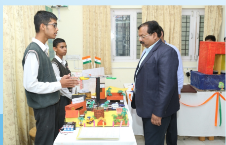
ATL Lab Inspection

The Talents, skills and abilities of each student need to be identified, nurtured and encouraged so that could be able to reach the Pinnacle of success. We provide a platform to think, express and exhibit their skills, Our P.P.J family has students from more than 18 states and we strive hard to make best possible efforts to inculcate strong values combined with academics and extra curricular activities in the children. Converting every individual into self-reliant, independent and responsible citizen of India. I promise to all my stakeholders that our team of P.P.J will leave no stone unturned for the holistic development of all the students and in transforming them into ' Enriched citizen ' of India in this complete Residential School.